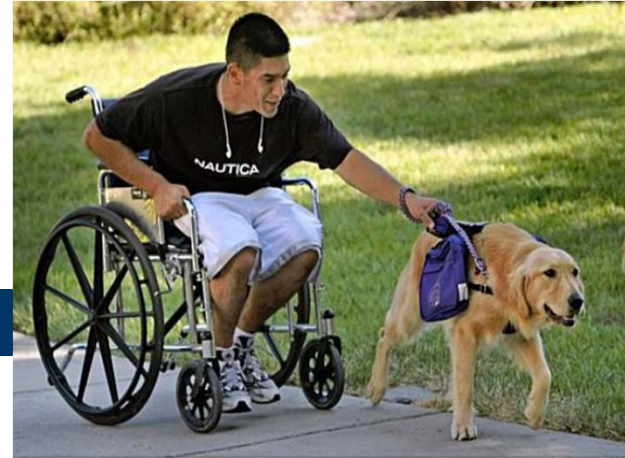
Frederic Larson / The Chronicle