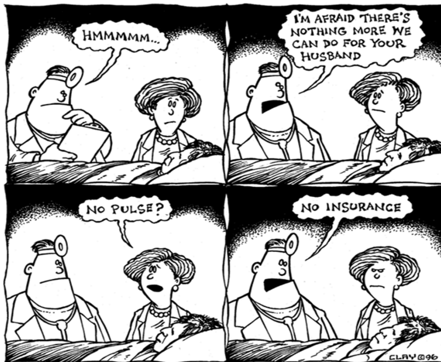
Sidewalk Bubblegum ©1996 Clay Butler